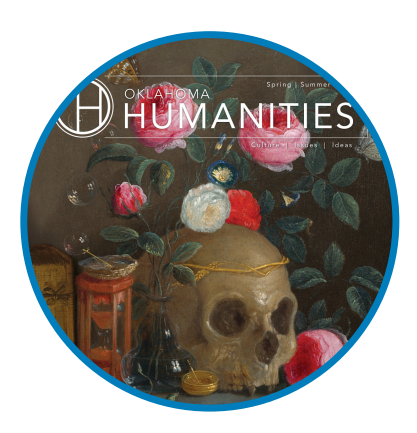
OKLAHOMA HUMANITIES magazine reaches over 12,000 per issue