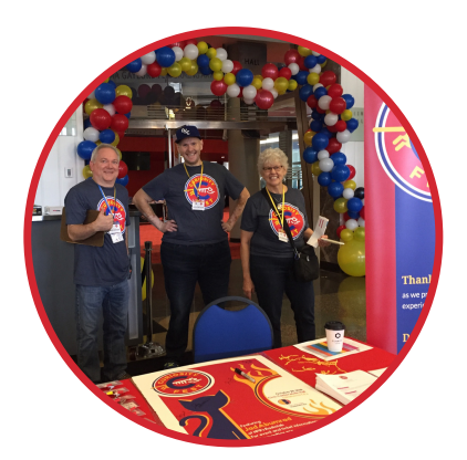
Oklahoma Humanities' inaugural CURIOSITY FEST

October 20, 2018 at Civic Center Music Hall